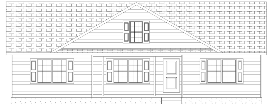
Exterior A: No Garage Addition